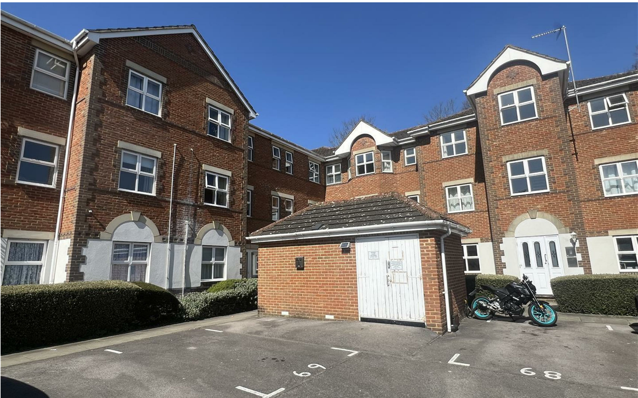
Regent Court, Norn Hill, Basingstoke, RG21 4HP